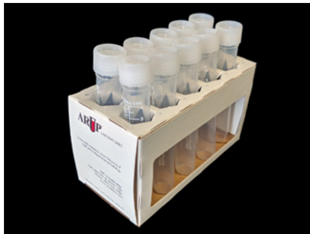
Each ARUP rack holds 10 tubes.

Couriers are prohibited from picking up specimens that are leaking or are not in secondary containers (i.e., ARUP color-coded specimen bags or pressurized specimen containers). Tube racks must be marked with the correct holding and transport temperature and placed in the corresponding temperature-specific, color-coded bags. Clients are responsible for packing specimens in the appropriate color-coded specimen bags. Tube racks meet the DOT requirement to keep fragile specimen containers from coming in contact with one another. Alternatively, fragile specimens must be individually wrapped in a specimen bag or with absorbent material.