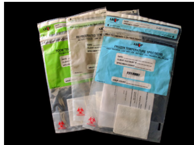
Green: Room temperature (ambient) specimens Gray: Refrigerated specimens Blue: Frozen specimens

i If submitting more than one specimen per patient, and if specimens need to be stored and transported at different temperatures, use separate bags and include the patient and specific test(s) on separate and temperature-specific packing lists (or manual requisitions).