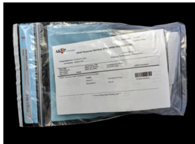
Packing list or test request forms fit into the outside sleeve.